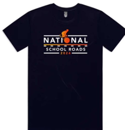
NATIONAL SCHOOL ROAD TEE