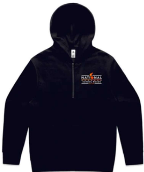
NATIONAL SCHOOL ROAD HOODIE

We are selling the official National School Road Championships clothing through ProBrands – there's a hoodie and tee available for purchase. Please check the ordering and delivery schedule on the website and choose the campaign most convenient for you. All the information can be found here .